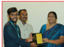
M Squared Software and Services Pvt Ltd