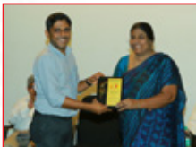
Infospica Consultancy Services