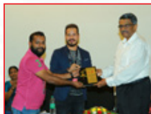
Fourspots Interactive Solutions Pvt Ltd