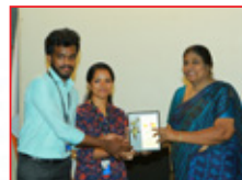
Polus Software Pvt Ltd