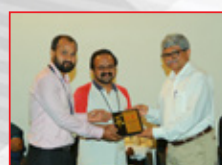
Vivekananda Study Circle