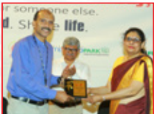
IIITM - K