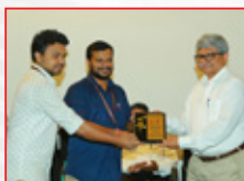
Prayan Infotech Pvt Ltd