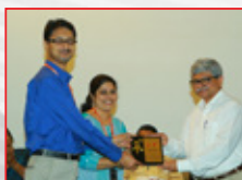
Suntec Business Solutions Pvt Ltd.