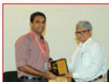
Qburst Technologies Pvt Ltd