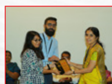
Zafin Software Center of Excellence Pvt Ltd.

Allianz Cornhill Information Services Pvt EYME Technologies Pvt Ltd. Finastra Software Solutions Flytxt Mobile Solutions Pvt Ltd Gemini Software Solutions Pvt Ltd IBS Software Services Pvt Ltd IIITM - K Quest Global Engineering Services Pvt Ltd UST Global Accel Frontline Limited Aegis Ltd Alamy Images India Pvt Ltd Applexus Technologies Attinad Software Pvt Ltd E Team Informatica India Private Limited Epica Studio Pvt Ltd EWIT Experion Technologies (I) Pvt Ltd Fourspots Interactive Solutions Pvt Ltd Infospica Consultancy Services M Squared Software & Services (P) Ltd. Mobile App developers Gemini Software Natana Navigant BPM (India) Private Limited Oracle India PIT Solutions Pvt Ltd Polus Software Pvt Ltd Prathidwani Prayan Infotech Pvt Ltd Qburst Technologies Pvt Ltd RM Education Solutions India Pvt Ltd RP Techsoft International Private Limited Speridian Technologies Pvt Ltd Srishti Innovative Computer Systems Pvt Ltd Suntec Business Solutions Pvt Ltd Tech Friends Toonz Animation India PVT LTD Triassic Solutions Pvt Ltd Vivekananda Friends Circle Zafin Software Centre of Excellence Pvt Ltd