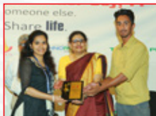
Flytxt Mobile Solutions Pvt Ltd