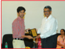
Epica Studio Pvt Ltd