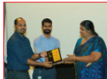
Mobile App Developers Gemini Software