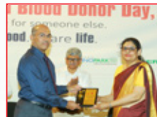
Gemini Software Solutions Pvt Ltd.