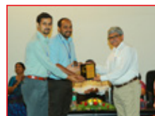
Srishti Innovative Computer Solutions Pvt ITD