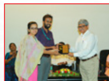
Speridian Technologies Pvt Ltd