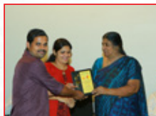
PIT Solutions Pvt Ltd.