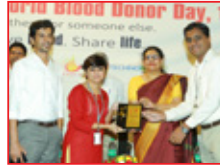
Finastra Software Solutions