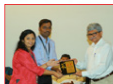
Triassic Solutions Pvt Ltd