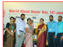
IBS Software Services Pvt. Ltd