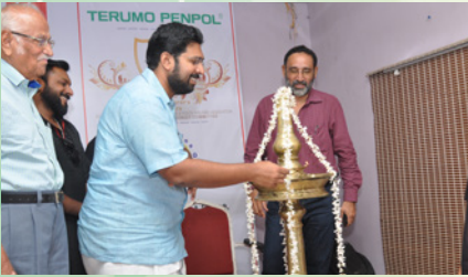
Mr. K S Sabarinathan , Member of Legislative Assembly- Inauguration and inaugural address