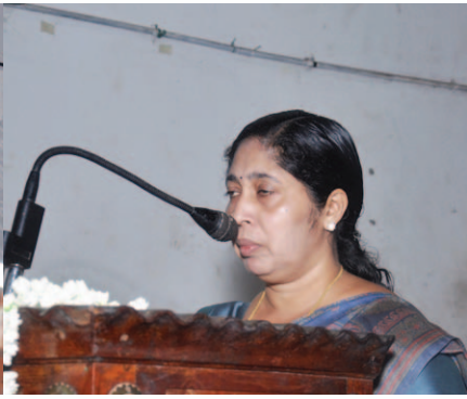
Smt Prasanna Earnest Mayor, Kollam Corporation