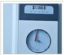
Eye level TRCU and seven day chart recorder

Our Deep Freezers are specially designed for blood banks, research institutes, and biotechnology firms. The storage of the multiple components of the plasma family within the prescribed temperatures (-80/-40) is ensured in Terumo Penpol Deep Freezers using its Rapid Freezing power.