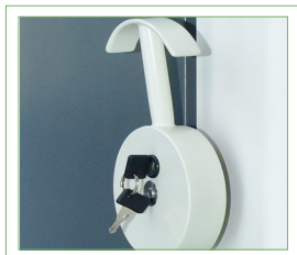
Ergonomically designed door handle