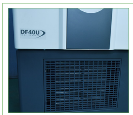
High efficiency condenser with fan