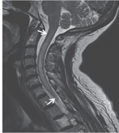
Figure 3: MRI of spine showing intramedullary demyelination in the spinal cord, evident as enhanced T2 signal, with peripheral contrast enhancement, extending from C2 to T1 vertebral body (arrows).

those of "typical" MS [1, 2]. ARF is unknown in MS. Cerebrospinal fluid and MRI findings can distinguish NMO from MS [3].