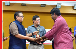
Sree Chitra Thirunal College of Engineering