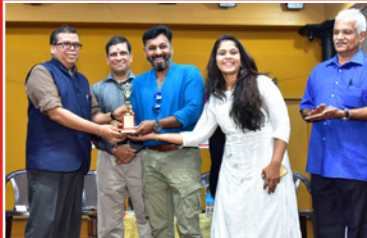
Big FM Radio is always in the forefront to promote blood donation