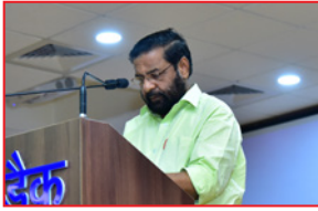
Inauguration – Kadakampally Surendran, Minister of Tourism, Devaswom and Cooperation