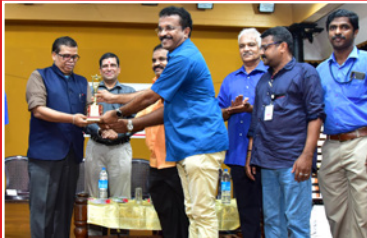
VSSC regularly organizes Blood Donation Camps