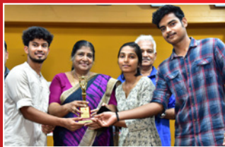
College of Engineering, TVM

The Knowledge regarding voluntary blood donation was adequate among the CET students and the students used to donate blood regularly. The most common reason for donating blood was a sense of social responsibility and most common reason of non-donation was fear of the procedure. An 85% of the students were of the view that they would donate blood if asked. Students suggested that small incentives like certificates and arranging transport for blood donation would make it easier to donate.