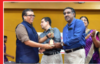
Muslim Association College of Engineering