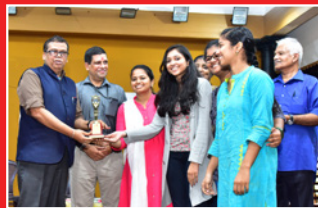
LBS Institute of Technology for Women