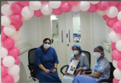
NH SRCC Hospital- Mumbai