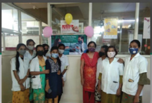
Akshay Blood Bank- Solapur