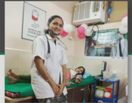
Sankalp Blood Bank- Kalyan