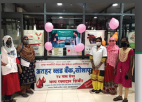
Athar Blood Bank- Solapur