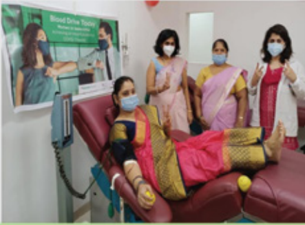
Ruby Hall Clinic- Pune