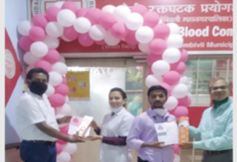
Chidanand Blood Bank- Dombivli