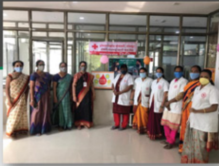
Damani Blood Bank- Solapur