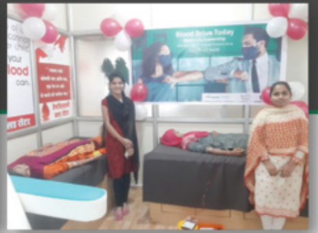
Vaibhav Lakshmi Blood Bank - Kolhapur