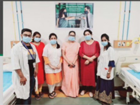
Jupiter Hospital- Thane