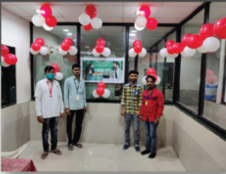
Lions Blood Bank Aurangabad