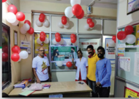
Aurangabad Blood Bank Aurangabad